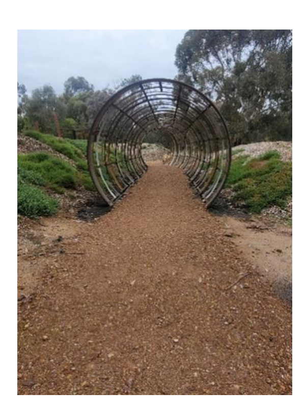
Image caption: walking path surface upon entry to the dance circle compacted gravel (on left) and gravel pathways on the daanak trail (on the right)

puddles. Care is required when traveling along these paths.