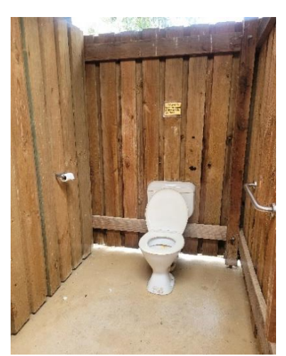
Image caption: Entrance at 820mm, toilet cubicle entry at 560mm and women's toilet with handrail.