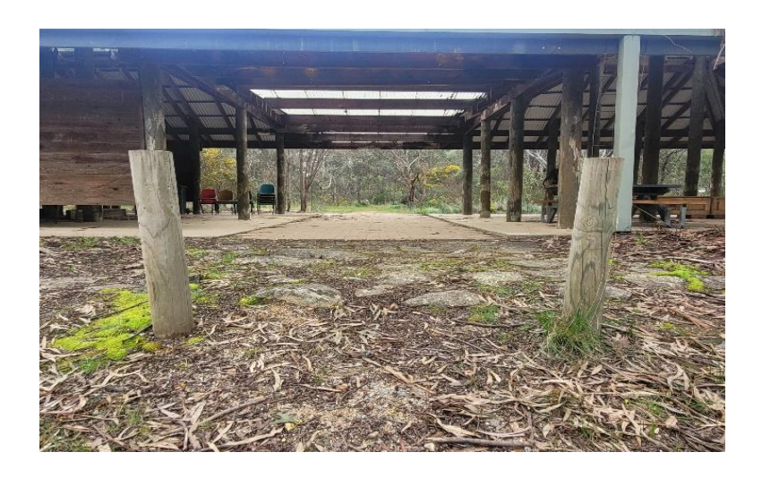
Image caption: Image of surface from carpark to the picnic shelter – small incline with rocks, before reaching the concrete surface of the shelter. There are picnic tables and chairs at the shelter. The picnic tables are not accessible.